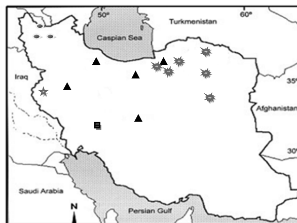
Fig 1. Distribution map of A. lanceolatum (★), A. mulleri (▲), A. persicum (■), A. baumgartnerianum (●) and A. lepidoto-stellatum (★).

Type specimens of species section Gamosepalum presented in Herbarium of Natural History Museum of Vienna (W), Herbarium of Boissier (G), Herbarium of Research Institute of Forests and Rangelands (TARI) and Herbarium of Ferdowsi University of Mashhad (FUMH) were studied. All of the species belong to the section Gamosepalum that were introduced as new records from Iran, were morphologically investigated. The flowers of them were boiled and dissected. Sepals of types were selected for scanning by electronic microscope (SEM) and light microscope (LM). They were mounted and coated with gold-palladium. After coating specimens were viewed with a SU 3500 Electron microscope at 15 kv. Make a determination key for section Gamosepalum in Iran. The Examined specimens for all species of section Gamosepalum were illustrated in map (Fig.1).