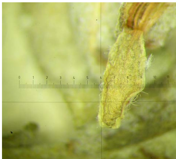
Figure 3. Inner surface of sepal in type specimen of A. muelleri by LM.

Leaves oblanceolate or lanceolate, 9-27 × 2- 2.5 mm. Sepals indumentums many rayed, in the inner surface with stellate hairs (Fig. 3c) . Petals 6-8 × 1.5-2.2 mm, entire, yellow, spatulate, with sparse stellate trichome. Fruits orbicular or suborbicular, subretuse, 4-5.5×4-6 mm, with dense canescent – silvery indumentums of leptidote or sublepidote hairs. Styles 2-3.5 mm.