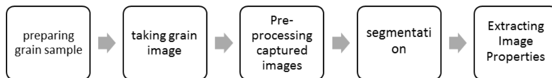
Fig. 1. Basic steps of measuring the grain's geometric properties using image processing.

The steps in processing digital images of grain are as follow (Figs. 1 and 2): Image rotation, image blur, and so forth. A set of operations that done to correct or reduce these errors is called preprocessing. The preprocessing operation performed by moving the images from RGB space to HSV image space.